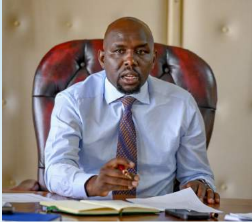
Cabinet Secretary of the Ministry of Roads and Transport, Kipchumba Murkomen, EGH,

between peak and off-peak demand in Kenya on a normal day is about 1000 MW. To maintain system stability, power generation is generally curtailed during these off-peak periods. According to the Energy and Petroleum Regulatory Authority (EPRA) statistics, a total of 495,437 MWh of energy was curtailed between July 2022 and June 2023. This is an average daily curtailment of over 1357 MWh. This is a lot of energy that could be used to create demand at night. E-mobility can help bridge this gap by charging EVs, especially at night. On average, a 51-seater bus has a battery capacity of 180-200 kWh to give a 200 km range. The daily curtailed energy can therefore put about 7,000 electric buses or over 200,000 electric motorcycles on the road.