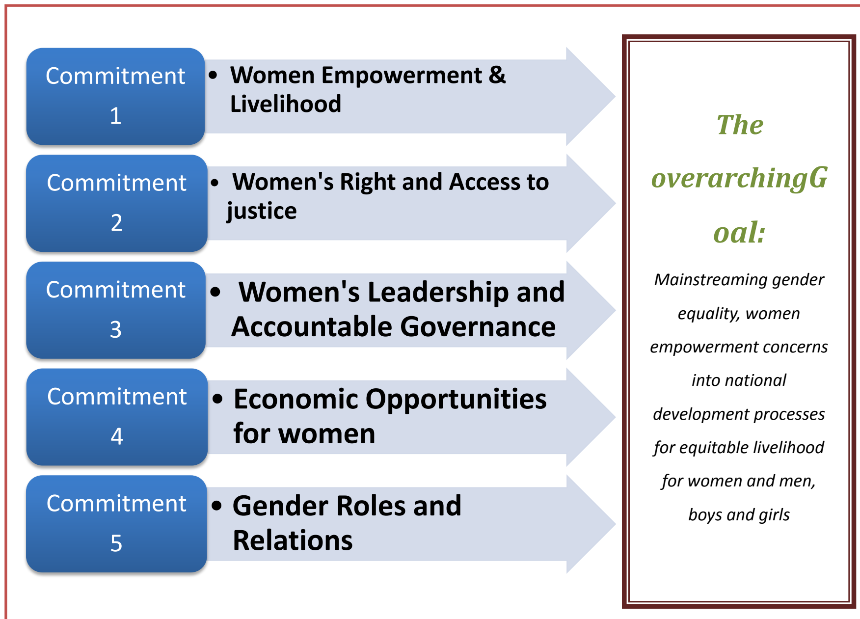
Figure 1 : Policy Commitment Value Areas