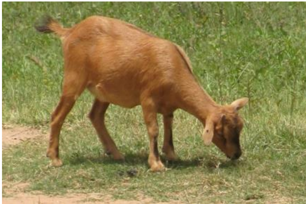
West African Dwarf nanny goat