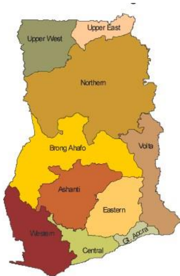
Figure 1: Administrative Regions of Ghana

Ghana, officially the Republic of Ghana and formerly the Gold Coast, is situated in the centre of the countries along the Gulf of Guinea in West Africa. The country has an area of 238,530 square kilometers and lies between latitudes 4°44' and 11°11'N and longitudes 01°12'E and 03°11'W. It is bordered on the east, west and north by the Republics of Togo, Côte d'Ivoire and Burkina Faso respectively. There is a 550 km long coastal line in the south.