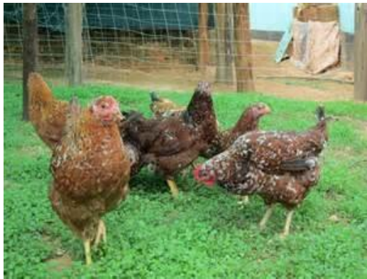
Local Ghanaian chicken