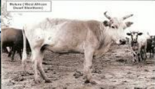
West African Shorthorn cattle