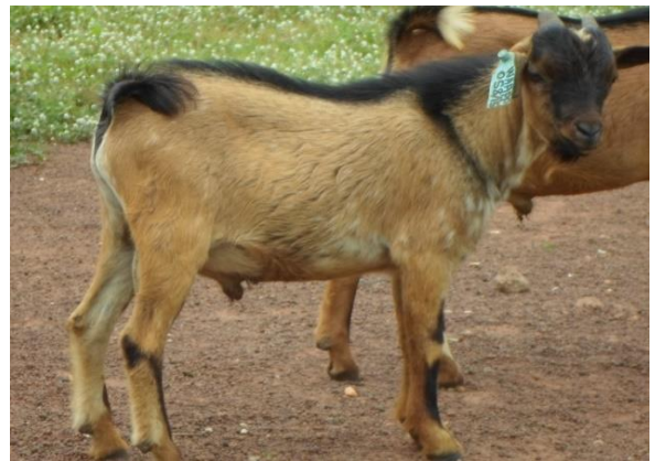
West African Dwarf Billy goat