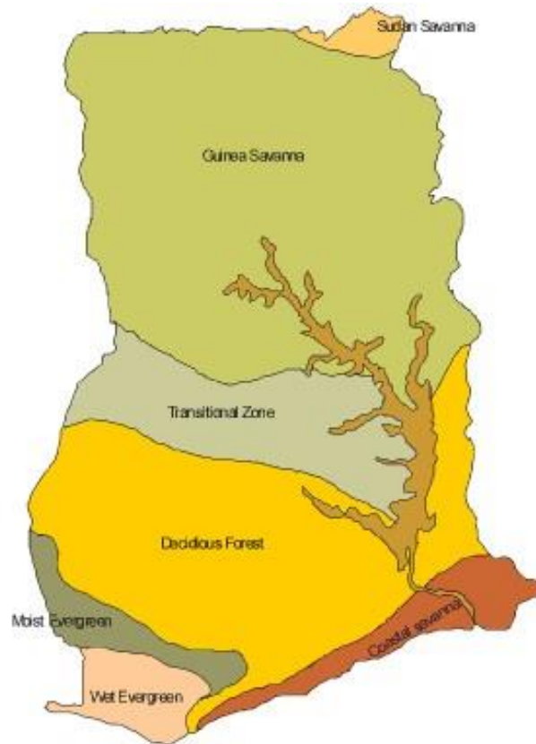
Figure 2: Ecological Zones of Ghana

the coast to 28.9 0 C in the extreme north. Temperatures may rise above 40 0 C though. The climate is usually breezy and sunny (SRID, 2014).