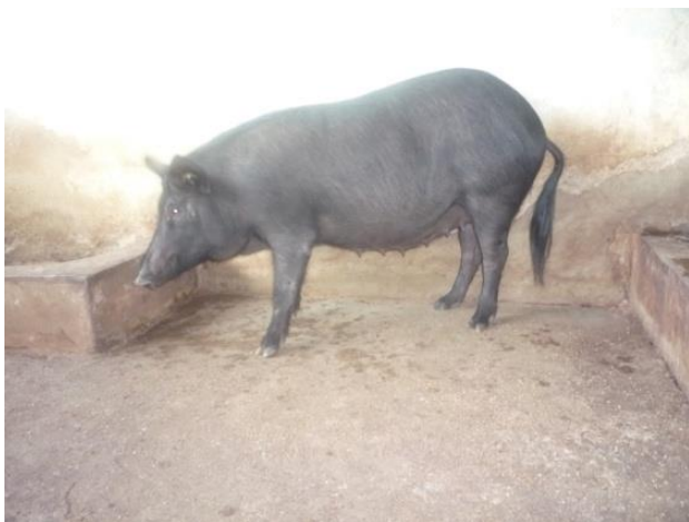
Ashanti Black pig