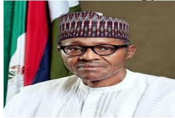
PRESIDENT MUHAMMADU BUHARI President, Commander-In-Chief of The Armed Forces, Federal Republic of Nigeria. Chairman of the Commission