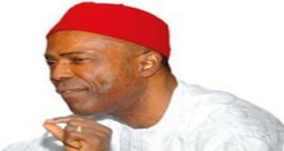
Dr Ogbonnaya Onu Minister of Science and Technology