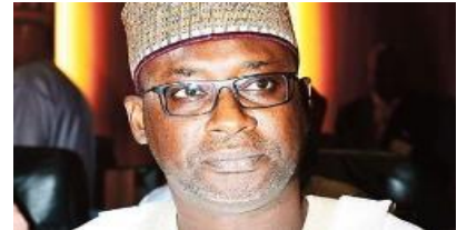
Engr. Suleiman Adamu Minister of Water Resources