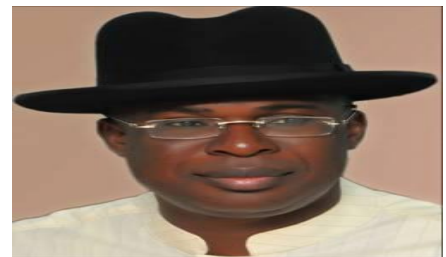
Timipre Silva Minister of State Petroleum Resources