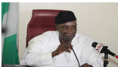
Mohammed Sabo Nanono Minister of Agriculture