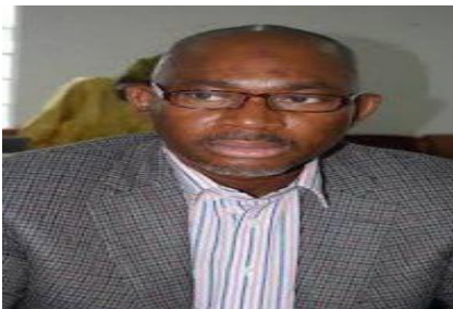
Olamilekan Adegbite Minister of Mines & Steel Development