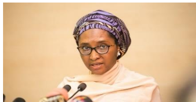
Zainab Shamsuna Ahmed Minister of Finance, Budget and National Planning