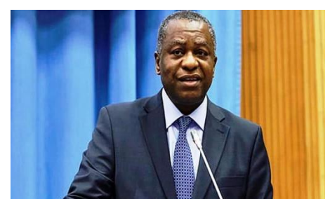
Geoffrey Onyeama Minister of Foreign Affairs