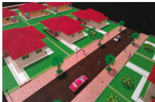
Proposed Satellite Town