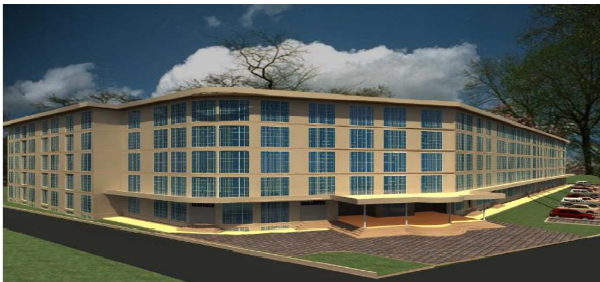
A proposed building at Sekei

Construction of Modern Market at Sekei, the area for investment is owned by Arusha District Council, Sekei village and has 2.3 acres. The modern market's expected to have seven storey building and it will cost an estimated amount of Tsh 35 billion. The area is surveyed and has title deed. Different socio-economic activities such as conference facilities, banking halls, departmental stores, restaurants, Curio shops, supermarkets and Car parking will be included when the project take off.