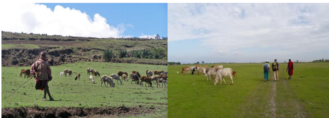
Area proposed for improving grazing land