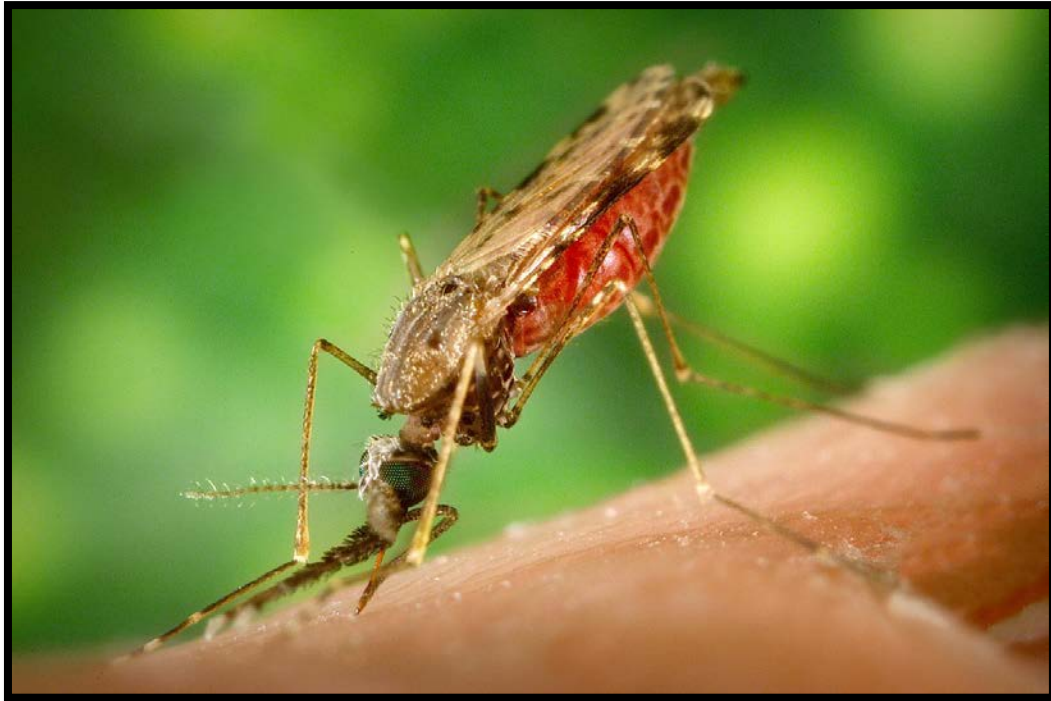
Figure 2: An Anopheles gambiae complex mosquito drawing a blood meal from a human host. Source: Photo Credit: James Gathany Content Providers(s): Centers for Disease Control and Prevention's Public Health Image Library (PHIL), with identification number #7861.