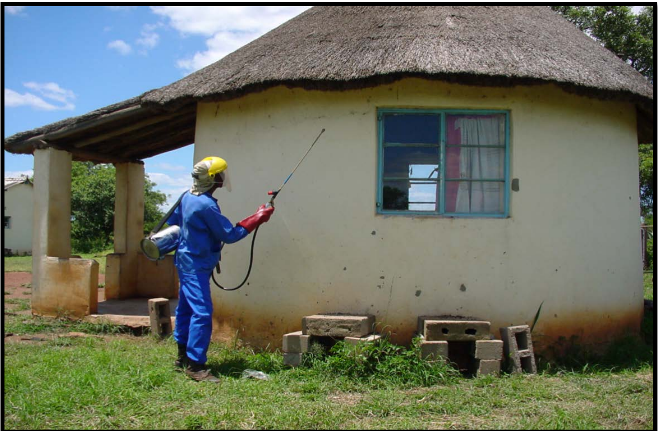
Figure 3: Insecticide residual spraying of eaves in a house in South Africa.