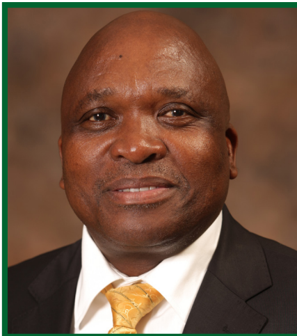
Dr M J Phaahla, MP Deputy Minister of Health

The implementation of this Ward-based Primary Healthcare Outreach Teams (WBPHCOTs) policy framework and strategy will do much to improve access to healthcare for poor and vulnerable communities in priority settings like the rural areas.