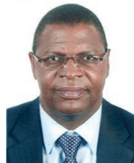
Prof. Welshman Ncube (M.P.) Minister of Industry and Commerce

Over the last decade and half, Zimbabwe's trade policy was guided by various trade-related laws and regulations administered by different Ministries, as well as bilateral, regional and multilateral trading arrangements that the country is signatory to. The role of trade in economic growth and development in the face of globalisation needs no emphasis. It is in this context that this comprehensive National Trade Policy was developed to ensure the effective and meaningful participation of Zimbabwe in the global market.