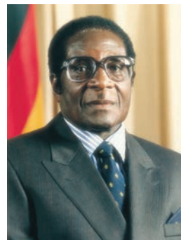
His Excellency, R. G. Mugabe, President of the Republic of Zimbabwe

Zimbabwe is endowed with a diverse and rich resource base with the potential to generate substantial export earnings for the country. The diversified manufacturing, agricultural, mining, tourism and other service sectors possess enough potential to give the country the necessary comparative and competitive advantage for sustained economic growth and development.